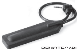
REMOTECABLE SWITCH VF9-VLT-SWPBK01 VF9-VLT-SWP-TN01